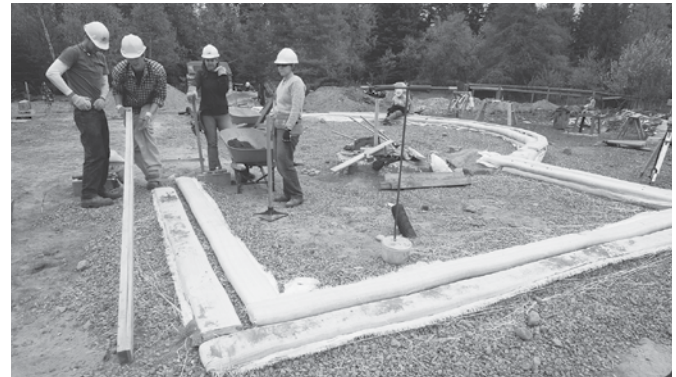
Earthbag foundation.